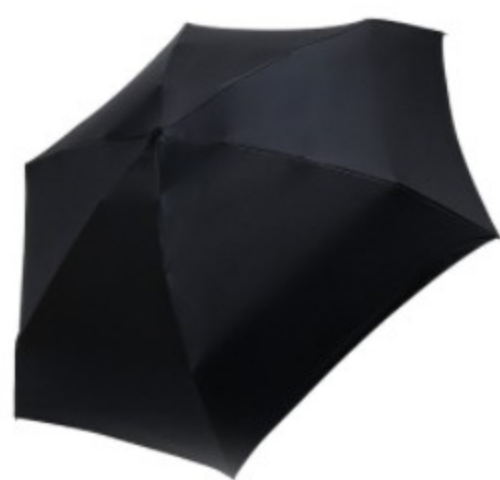
Uncategorized TOPDOMRUS Umbrellas and parasols,Outdoor Fashion Lightweight Folding Sun Umbrella Mini Umbrella