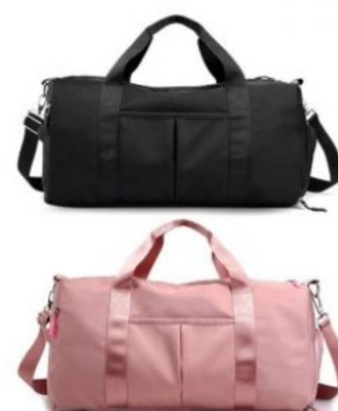
Uncategorized TOPDOMRUS Sports bags,Outdoor waterproof fitness sports bag multifunctional travel bag