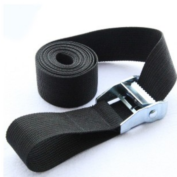
Uncategorized TOPDOMRUS Fitted belts for luggage,High Quality Strong Ratchet Belt Luggage Belt Cargo Strap