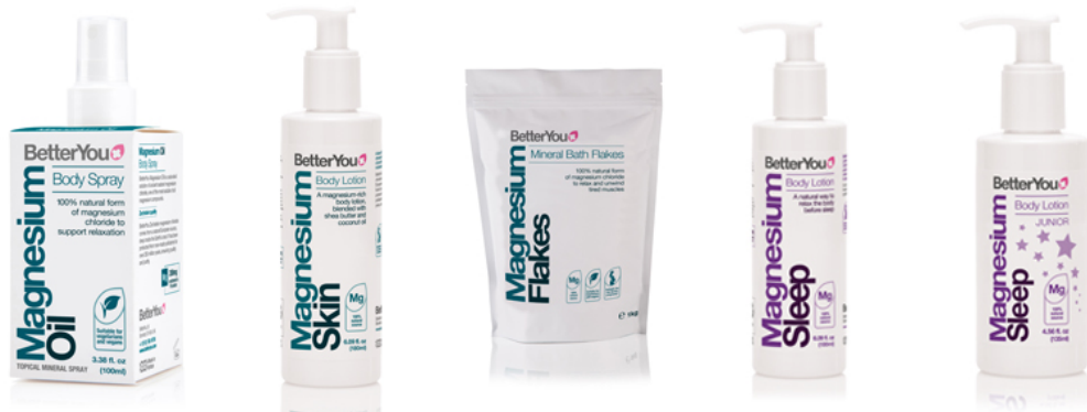
Magnesium Oil Body Spray

All BetterYou products are made with Ocean Waste plastic across the entire product range. Products are never tested on animals.