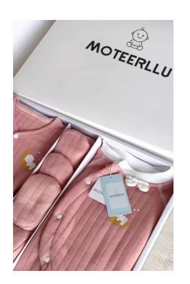
MOTEERLLU Baby girls footwear with mittens, cotton long-sleeved buttons Children's and $21.99