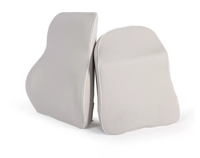
Bestmeta Head-rests for vehicle seats-Ergonomic durable pure memory foam car seat $30.99