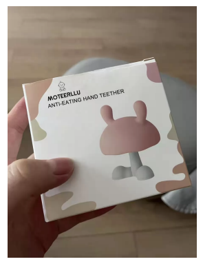
MOTEERLLU Pacifier-shaped babies comfort Infant toys, help breastfeeding and weaning and $19.99