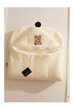
MOTEERLLU Hooded Sleeping bags for babies, warm baby packages for babies, warm sleeping $25.99