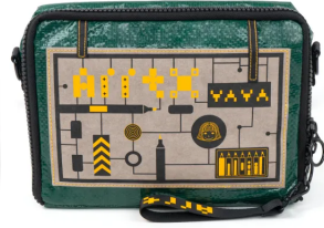
Arrtx Reticule #2 (7.71"x 11.02")