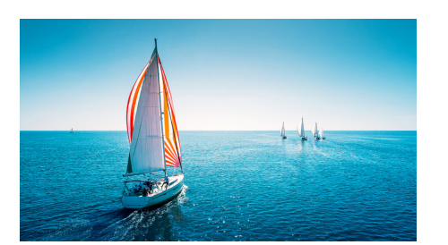
Finance, Government Contracting

Your Pipeline is Your Lifeline: Take These 5 Steps to Build a Strong One