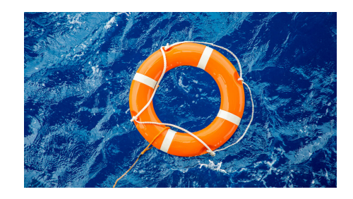
Finance, Government Contracting

Your Pipeline is Your Lifeline: Take These 5 Steps to Build a Strong One