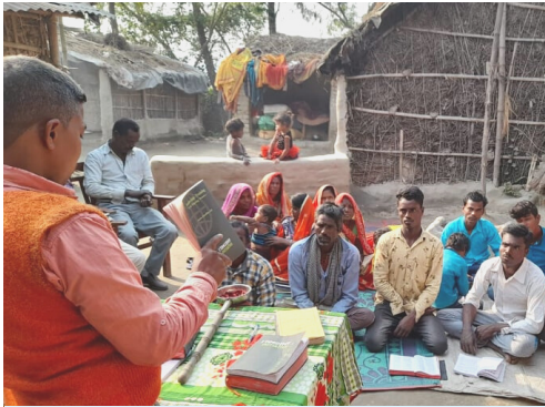
Project 001 - West Bengal, India

We're current on track to plant more than 100 churches in one of the darkest places in the world in 2021 for $20,000 .