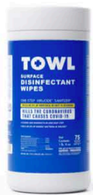
TOWL Surface Disinfectant Wipes – 75Ct Canister