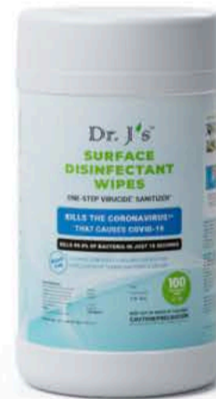
Dr J's Surface Disinfectant Wipes – 100Ct Canister