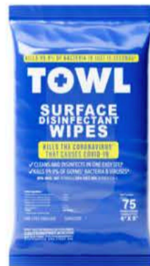
TOWL Surface Disinfectant Wipes – 75Ct Soft Pack