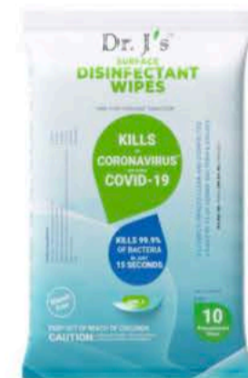
Dr J's Surface Disinfectant Wipes – 10Ct Soft Pouch