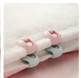
Quilt Fixing Clip Mini Anti-Slip... US $1.13 1 Sold