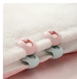
Quilt Fixing Clip Mini Anti-Slip... US $1.25