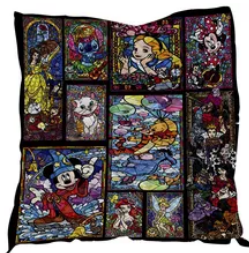
Disney Mickey Minnie Mouse... US $25.99