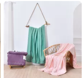
2021 new golden double Pala... US $217.49