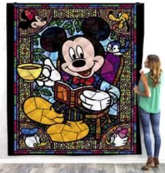
Disney Cute Mickey mouse S... US $25.99