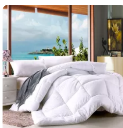
Autumn Winter Thicken War... US $49.02 9 Sold