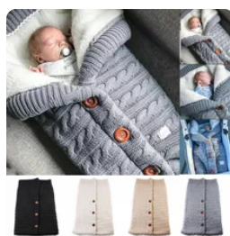
Newborn Baby Winter Warm ... US $4.50 4 Sold