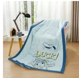
Disney Cartoon Cute Donald ... US $37.99