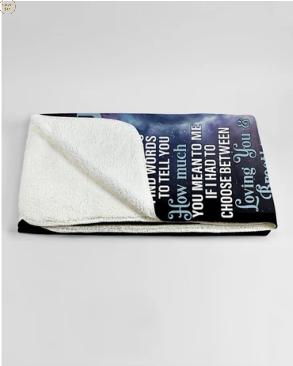
To My Son From DAD - Lion Sherpa Fleece Blanket - $52.99+