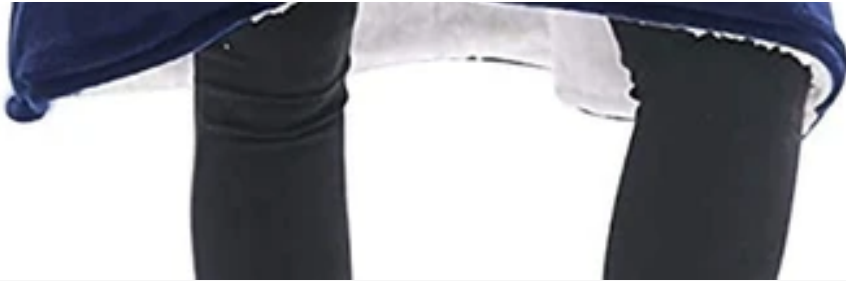
Oversized hoodie sweatshirt blanket - $29.99+