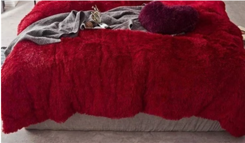
FLUFFY BLANKET WITH PILLOW COVER – $29.99+