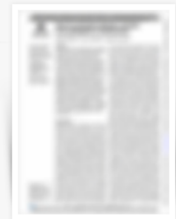
Seminal paper connecting oral pathogens to atherosclerosis.