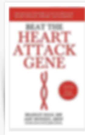
Bale & Doneen literally wrote the book on the subject.