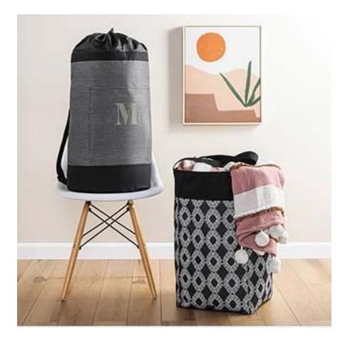
Home Organization <u>SHOP NOW ></u>