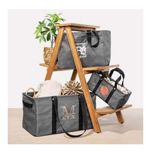
Utility Totes SHOP NOW >