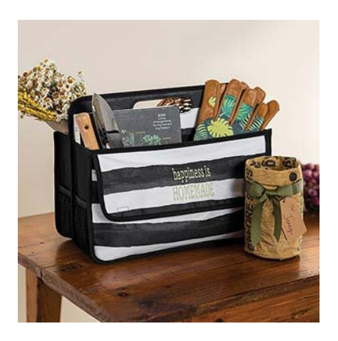
On-The-Go Organization SHOP NOW >