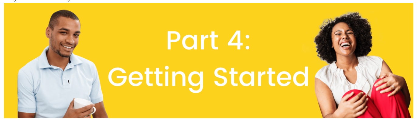
Step 1: Choose Your Package

For 45 days post-implementation, I will be on stand-by to answer questions, tweak processes, and adjust current systems to best fit live-action business activities.