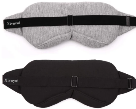
2 pack - grey and black