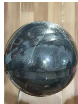
DBTHTSK Basket Balls, Composite PU leather, 29.5", for Street, Indoor, Outdoor(one)