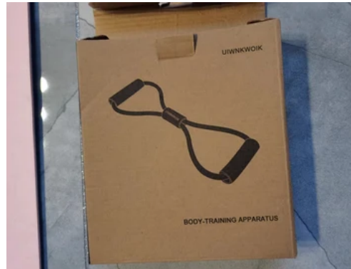
UIWNKWOIK Body-Training Apparatus, Back Trainer, Hest Expander, Open Shoulder, Suitable for Men and Women