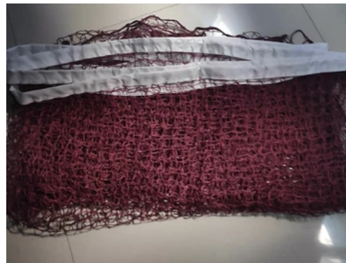
Vgossi Nets for Sports, Indoor and Outdoor Sports Garden Schoolyard Backyard (20 FT x 2.5 FT)