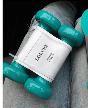
LOLURE Dumbbells, 2Pcs with Neoprene Coated for Hand Weights Training, Skinny Legs Thin Waists