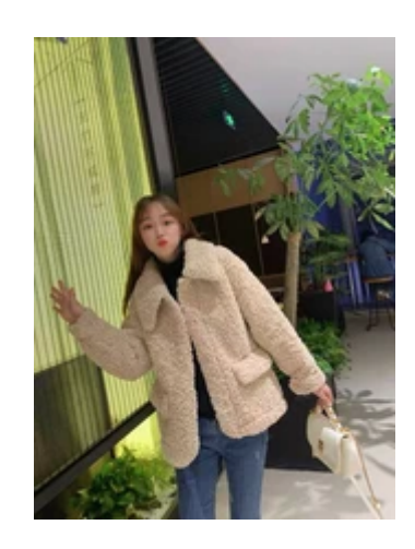
savasanaut Coats, Women's Fashion Long Sleeve, Lapel Zip, Faux Shearling Shaggy Oversized Coat Jacket