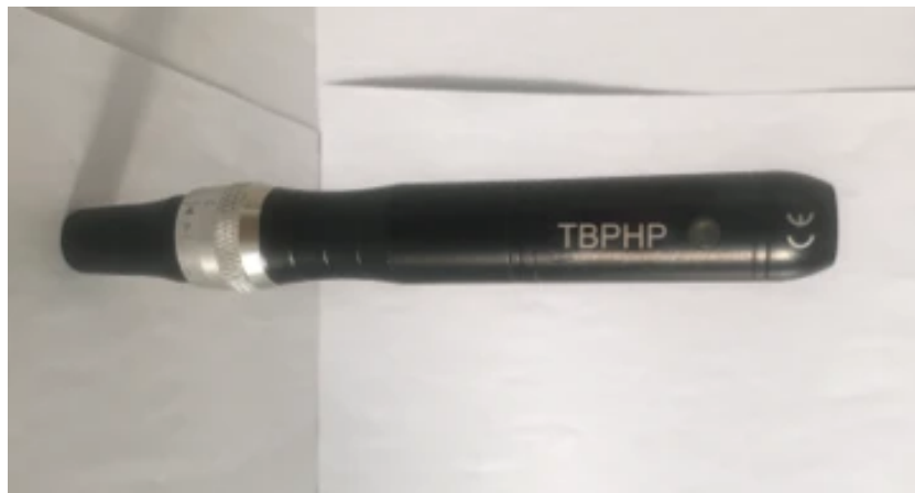
TBPHP Microneedle Dermal Roller, Microdermabrasion Beauty Derma Pen, Titanium Micro Needles Skin Roller $43.99