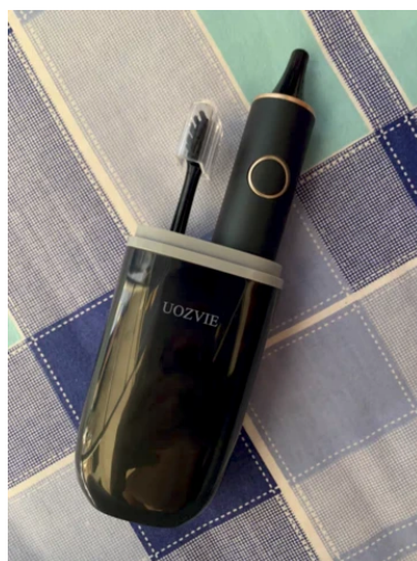
UOZVIE Electrical Toothbrushes, for Adults and Teens, 5 Modes, with Smart Timer (Black) $18.99