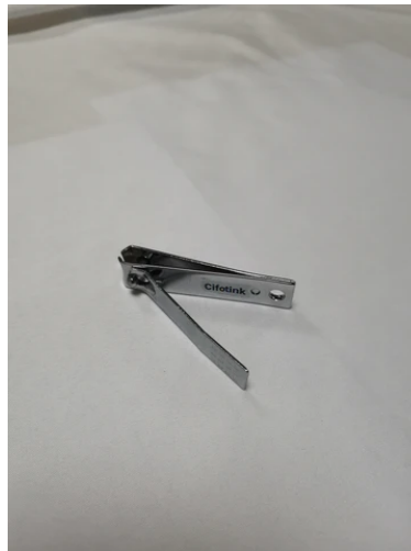
Cifotink Fingernail Clippers, Stainless Steel Fingernail Clippers for Men & Women - Curved Blade $6.99