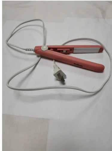
Dolkoic Electric Hair Straightener, for All Hair Types for Hair, Lightweight & Portable $34.99