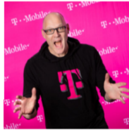
BUSINESS PORTRAITS / HEADSHOTS