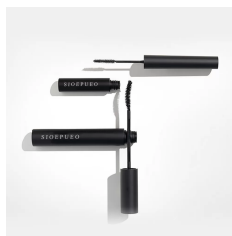
SIOEPUEO Curling & Lifting Mascara Cu... $25.69 $38.99