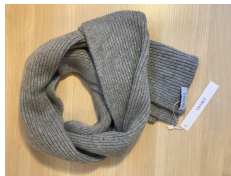
YKTSUJ Women's Warm Long Shawl Winter Warm Large Scarf Pure Color $12.99