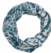
YKTSUJ 35" Ladies Satin Square Silk Like Hair Scarves and Wraps Headscarf for $12.99