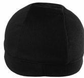
YKTSUJ men's cycling caps, unisex in summer and winter, 2 pieces