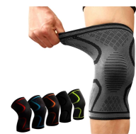
1PCS Fitness Running Cycling... US $2.75 14978 Sold