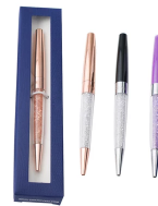
New lady student lovely cryst... US $3.12 397 Sold