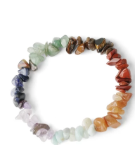
CSJA Reiki Natural Stone 7 Ch... US $1.53