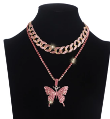
Iced Out Butterfly Necklace S... US $5.98 2039 Sold