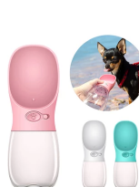
Portable Pet Dog Water Bottl... US $7.99