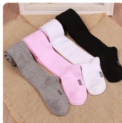
YWHUANSEN 0-6Yrs Children... US $1.79