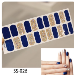
SS-026 Recuerdame 22tips Nail Art A... US $0.87 1634 Sold