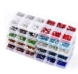
1200pcs Mix Sizes Glass Crys... US $1