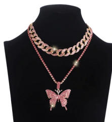
Iced Out Butterfly Necklace S... US $5.98 1878 Sold