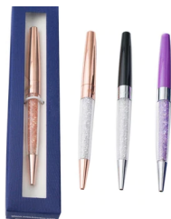
New lady student lovely cryst... US $3.12 350 Sold