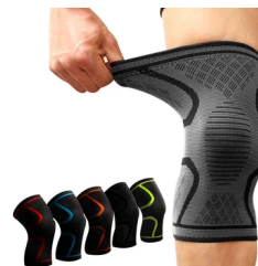
1PCS Fitness Running Cycling... SALE US $2.79 14968 Sold