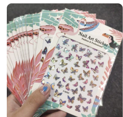
5/16pcs Holographic 3D Butt... US $3.99 1409 Sold