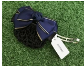
Arelove Hair Snood Net Barrette Mesh Clip Elastic Butterfly Bun Bow Headdress 2Pcs