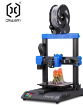
Artillery® Genius 3D Printer Kit 220*220*250mm Print Size with $399.00