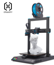
Artillery® Sidewinder X1 SW-X1 3D Printer 300x300x400mm Large $499.00