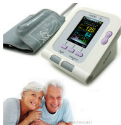
Digital Automatic Intellisense Upper Arm Blood Pressure...