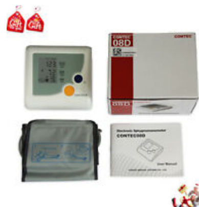
FDA Ambulatory Blood Pressure Monitor Sphygmomanometer...