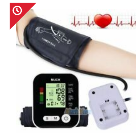
Digital LCD Arm Blood Pressure Pulse Monitor Health Care Up...