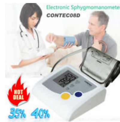
Auto Digital Arm Blood Pressure Monitor BP Cuff Machine Color...