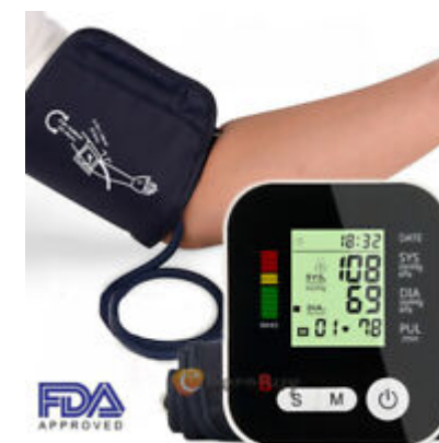
Digital LCD Upper Arm Blood Pressure Pulse Monitor Auto...