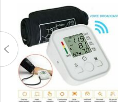
Upper Arm Blood Pressure Pulse Monitor Health Care Digital LC...