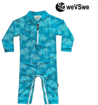
View larger image