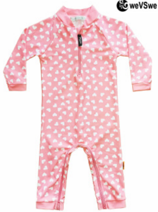
View larger image