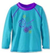
Sun protective clothing for toddler UPF 50 swimwear...