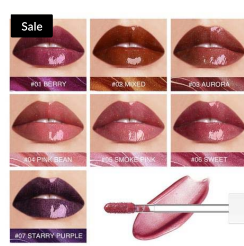
O.TWO.O 7 Colors Mirror G... $5.46 $13.65