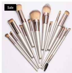
Lemoda Professional Makeu... $0.02 $0.05