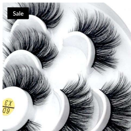
HBZGLAD New 7 pairs natu... $6.74 $16.85