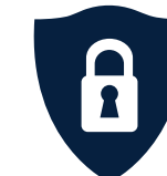
Enhanced Security (Network, Data, Endpoint, Web)