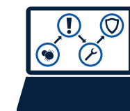
Advanced Threat Detection