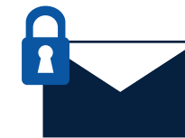
Email Management & Security