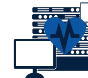
Device Health Monitoring