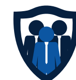
User Awareness Training