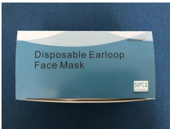
MASZONE Single Use Disposable Face Mask (Pack of 50), Blue $39.99