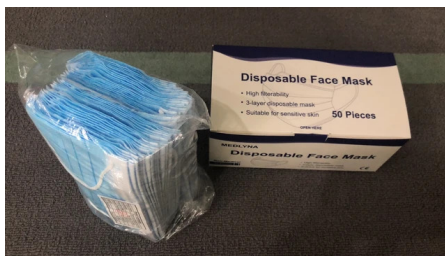
MEDLYNA Disposable Face Masks - 50 PCS - 3-Ply Breathable & Comfortable Filter Safety Sanitary Mask $69.99