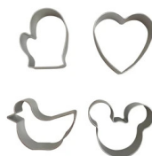
Rizzari Stainless Steel Cookie Cutter Set, DIY Mold Shapes Cookie Mold Cutting Mold, Cartoon Baking Mold, Fondant Tool Pastry Biscuit Cake Baking Mould (Set of 4 pcs) $29.99