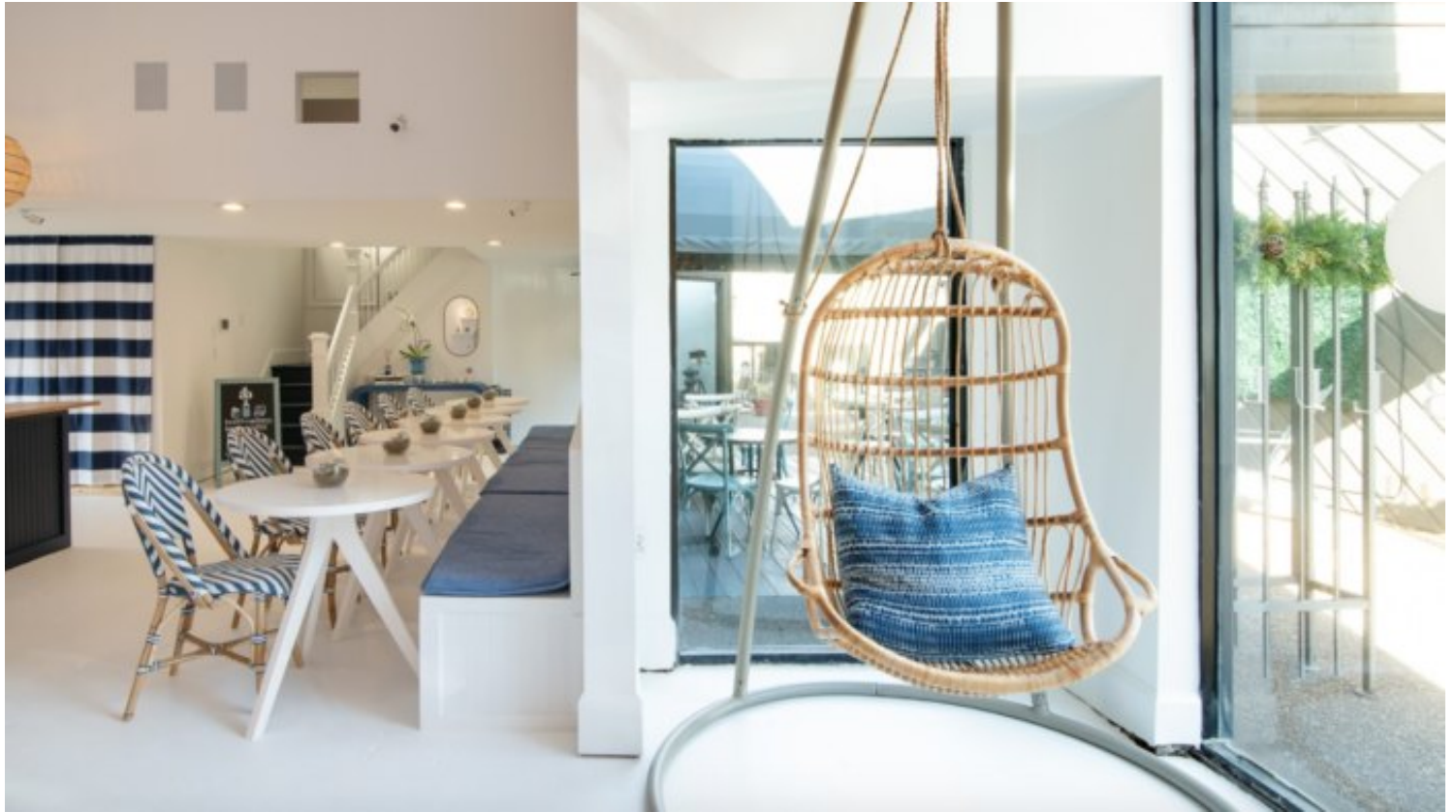
Anzie Blue - GoogleMaps

Visit Anzie Blue for yourself from 8 a.m. to 1 p.m. on Sundays, and from 8 a.m. to 5 p.m. the rest of the week.