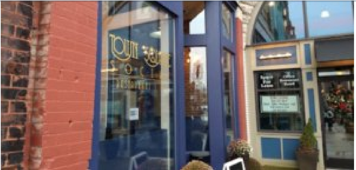
Get Some Take Out With A Quick Trip Out Of The City To Town Square Social Just A Short Drive From Nashville