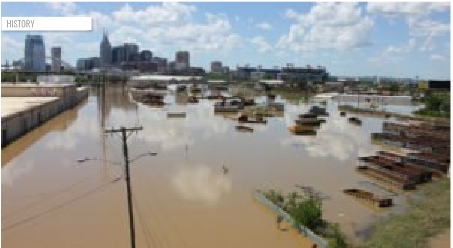
It's Been 10 Years Since Nashville Experienced Its Most Devastating Flood In History