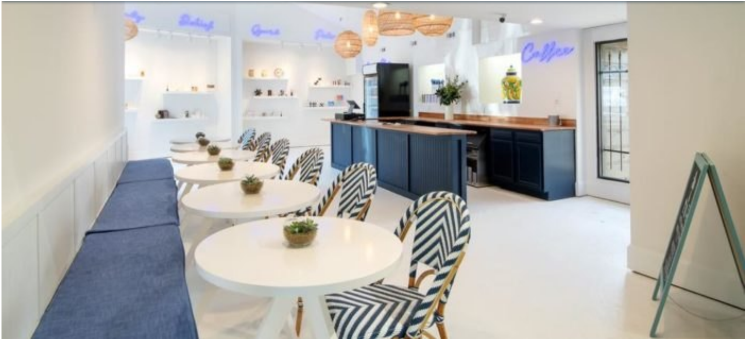
Anzie Blue - Facebook

Anzie Blue sure has the corner on the market when it comes to providing a beauty, health and wellness focus at a coffee shop. You'll find all sorts of luxury CBD products on the shelves, and a decadent menu to boot.