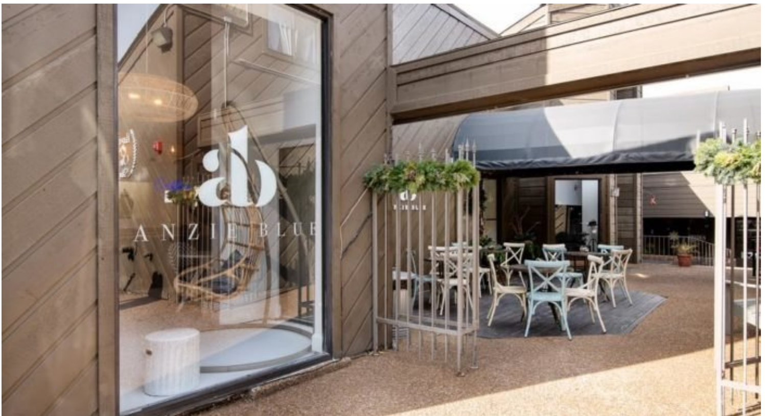
Anzie Blue - Facebook

Anzie Blue sure has the corner on the market when it comes to providing a beauty, health and wellness focus at a coffee shop. You'll find all sorts of luxury CBD products on the shelves, and a decadent menu to boot.