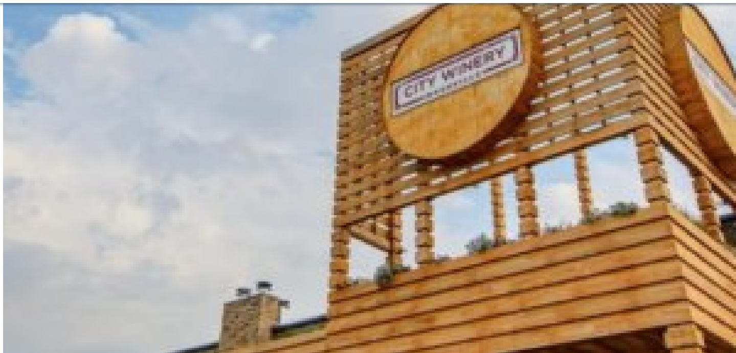
Take Pizza Night To New Levels With The Nutella Pizza At City Winery In Nashville