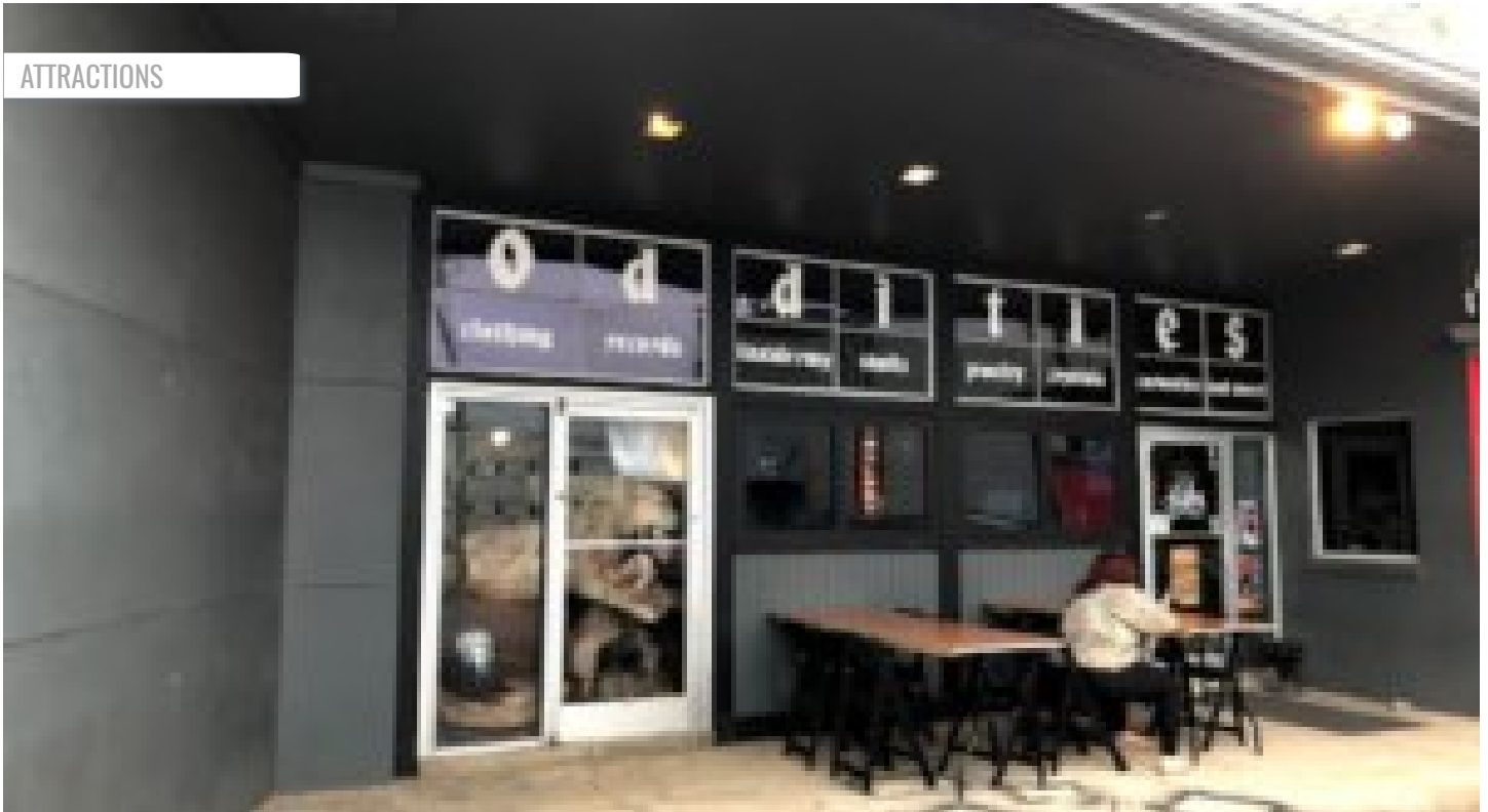
Get Lost In Shelves Of Bizarre Oddities And Items At The Completely-Bonkers Hail, Dark Aesthetics In Nashville