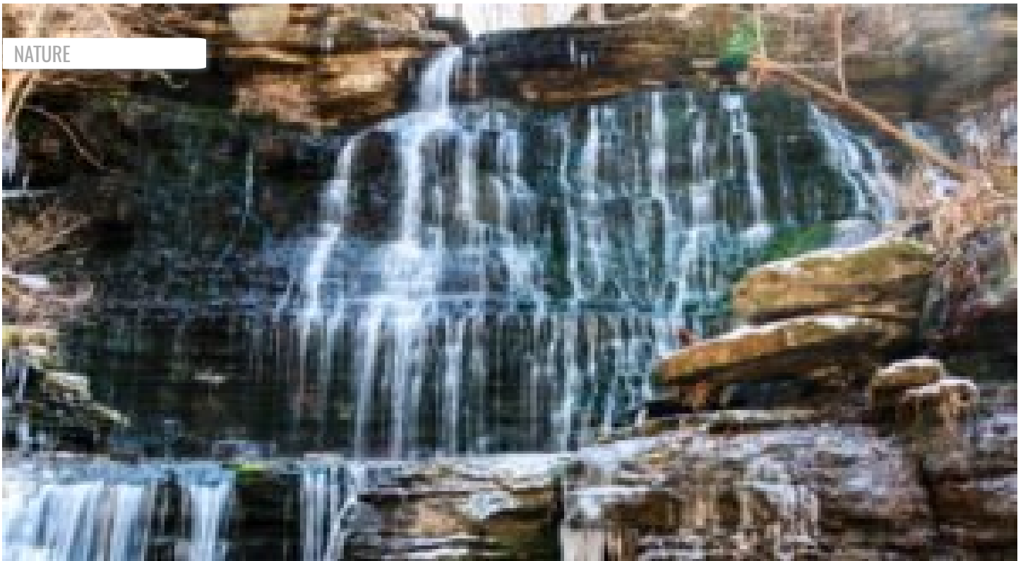
Enjoy Stunning Waterfalls And Gushing Springs On A Hike At Short Springs State Natural Area In Tennessee