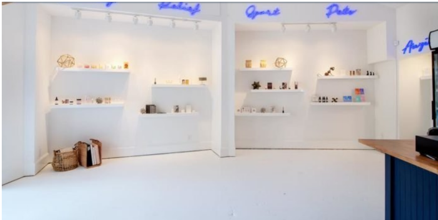
Anzie Blue - Facebook

Come browse the shelves and perhaps order yourself some Firepot tea. There's pastries available as well, and locals rave about the beautiful atmosphere.