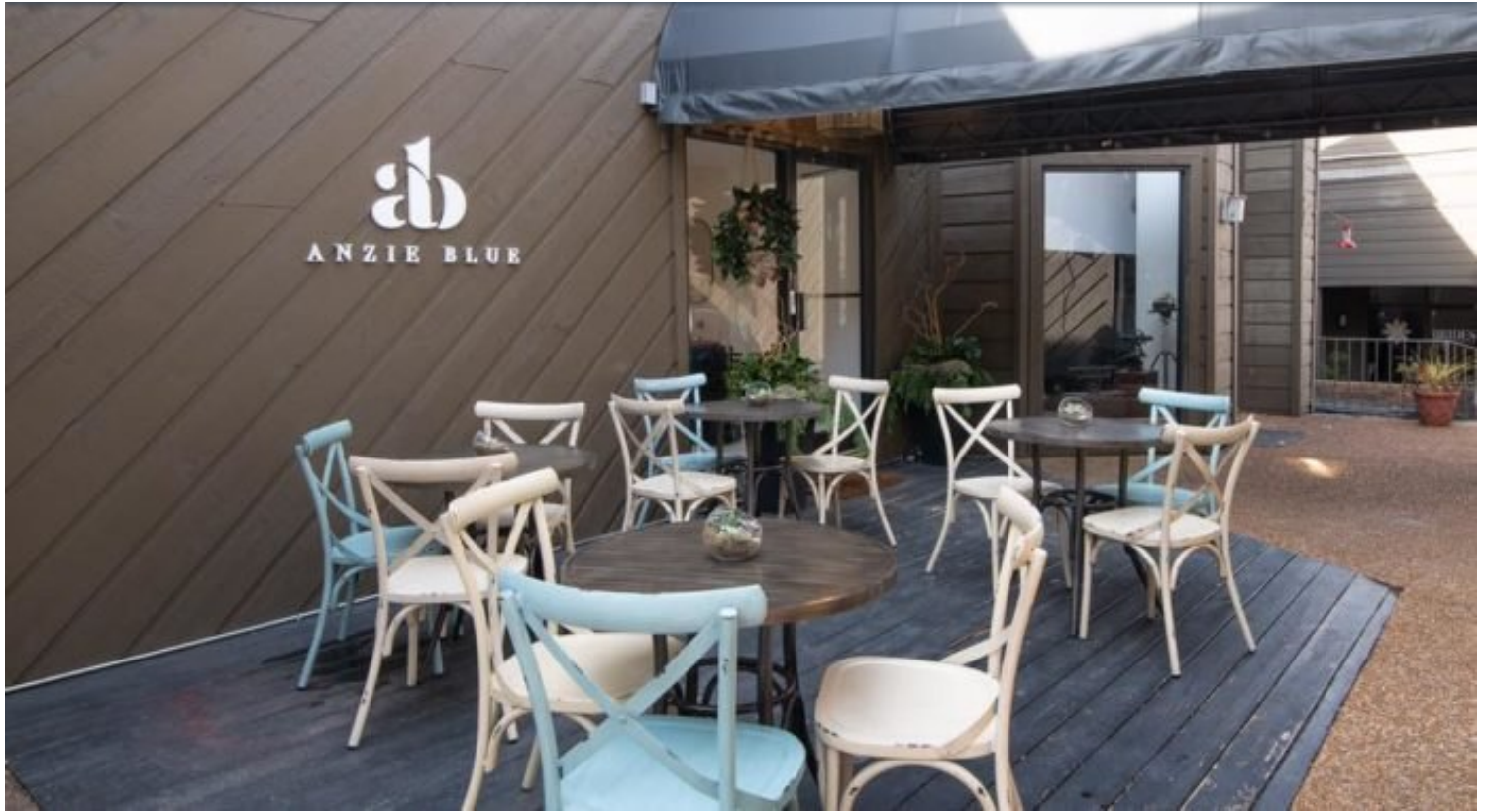
Anzie Blue - Facebook

You can learn a bit about Anzie Blue on your own with a visit to their official website or perhaps even their Facebook page .