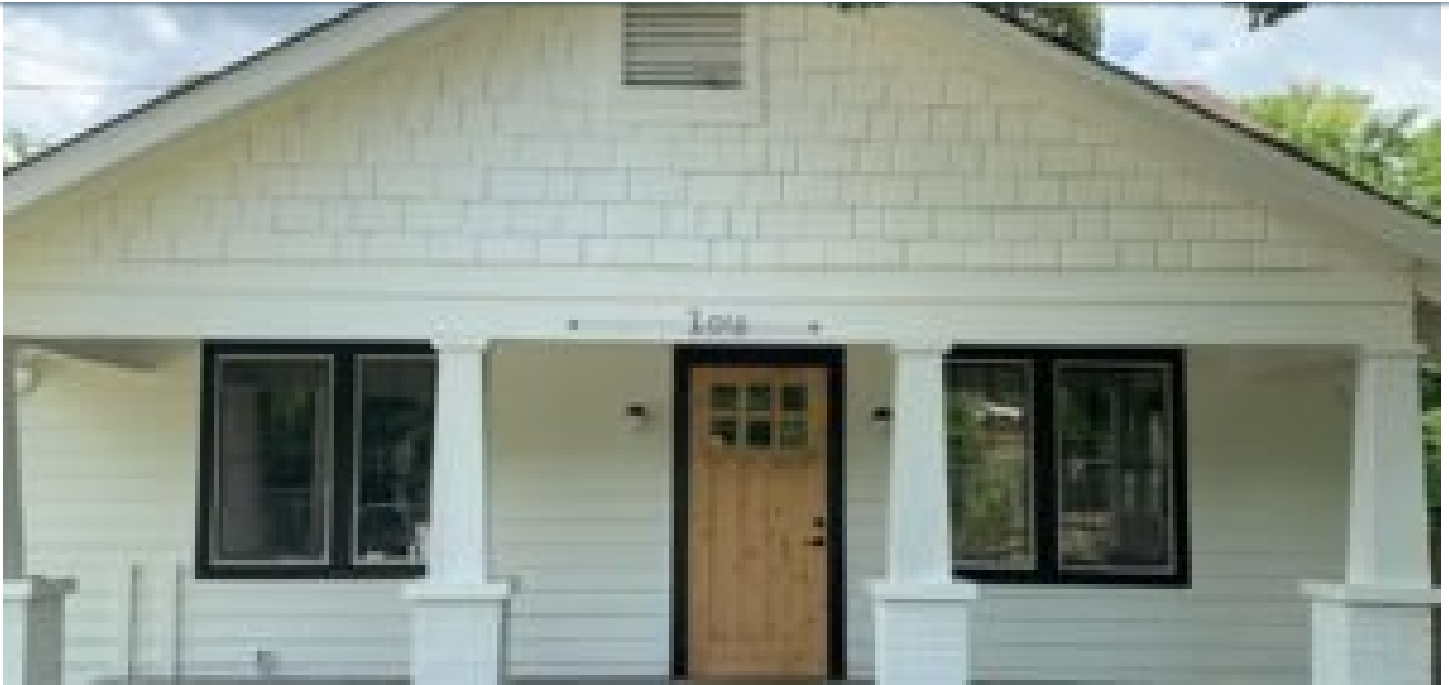
Order A Picnic To Go From Lou, A Local Favorite Restaurant In East Nashville