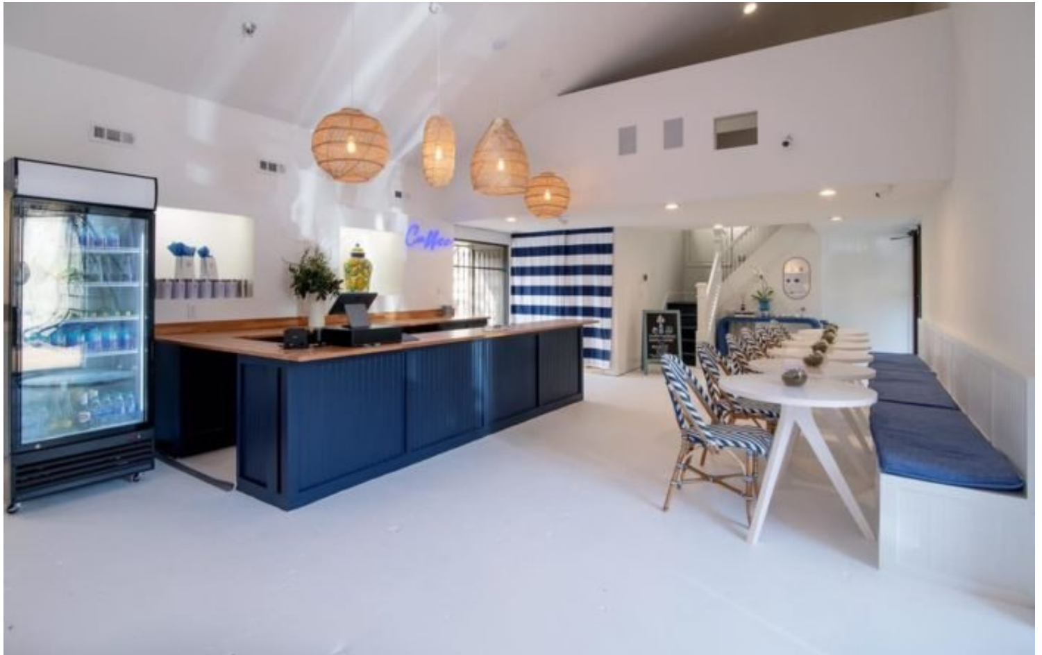
Anzie Blue - Facebook

Plus, the team at Anzie Blue is highly trained to educate visitors on CBD. Whether you have questions about using the product itself or simply want to up the ante on your wellness routine, there's something for you here.