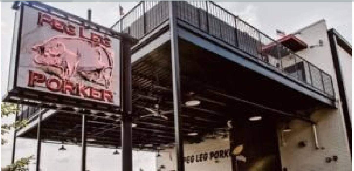
One Of Nashville's Favorite BBQ Joints, Peg Leg Porker, Is Now Open For Carryout And Delivery