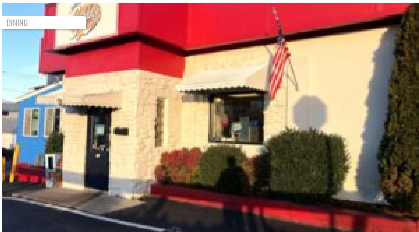
Hands Down, The Best Fries Are Found At Gabby's Burgers And Fries In Nashville