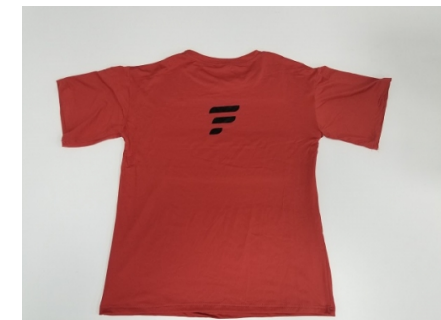
F Men's 2-Pack Standard-Fit Short-Sleeve Crewneck T-Shirt $15.99