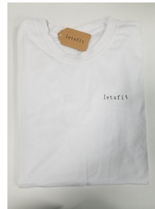
letsfit Men's Cotton Performance Short Sleeve T- Shirt $15.99