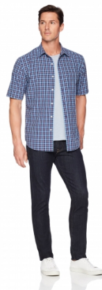
Flowershove Men's Regular-fit Short-Sleeve Poplin Shirt $17.99