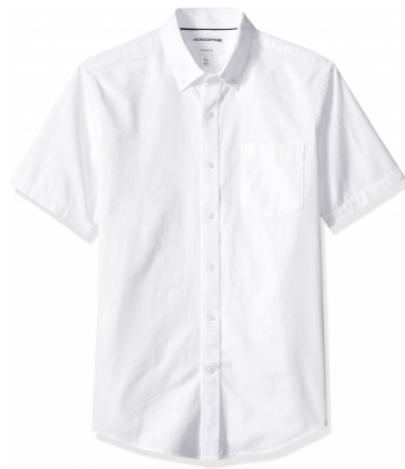
NERODAPPHIRE Men's Slim-Fit Short-Sleeve Pocket Oxford Shirt $19.99