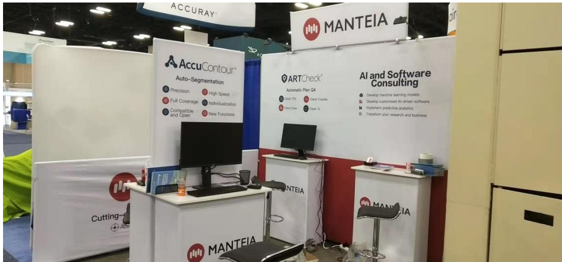
U.S.A ASTRO exhibition photos: