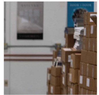
For Publicists & Agents