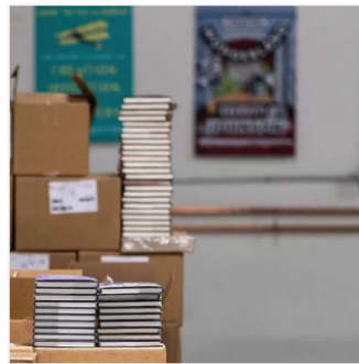
For Book Buyers