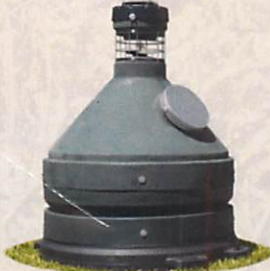
1000lb Deluxe Feeder