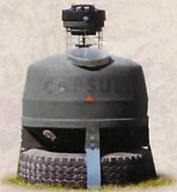
800lb Capsule Feeder