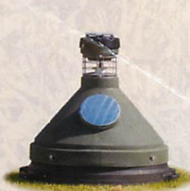
500lb Deluxe Feeder