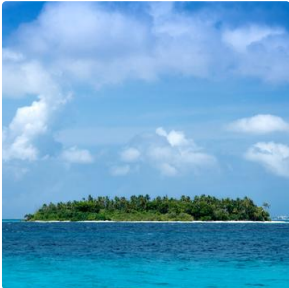
Soarin' Over The Sea - Ocean Breeze $18.25 1 review