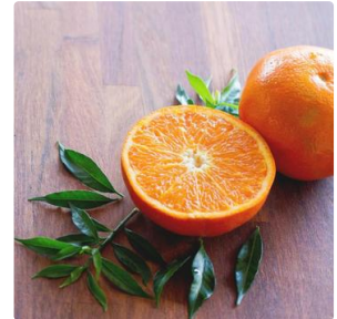
Grapefruit Glow (Grapefruit and Bergamot) $18.25 No reviews