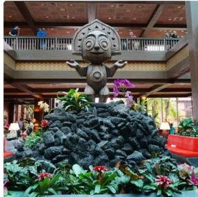
Polynesian Paradise - Tropical Spice $18.25 15 reviews