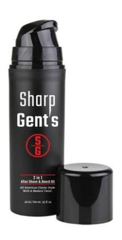
The After Shave $14.99