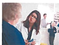
Introduction for Pharmacists