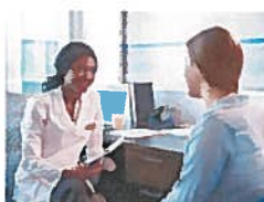
Introduction for Physicians and Advanced Practice Providers