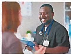
Introduction for Nurses

All patients admitted to Rush's inpatient medical and surgical units will be screened by nursing staff and social workers. These providers will be able to call the new substance use intervention team (SUIT) to come to the bedside to work with patients through motivational interviewing and, when appropriate, initiate medical treatments and refer patients to specialized treatment centers depending on the level of need.