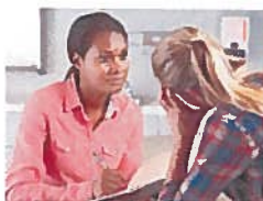
Introduction for Social Workers