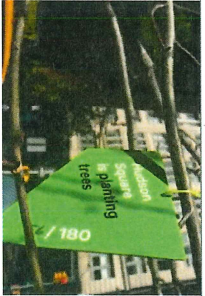
View More on Instagram