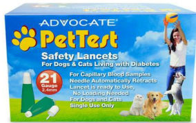
ADVOCATE PetTest Safety Lancets 21G x 2.4mm (100/box)