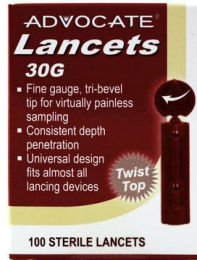
ADVOCATE Twist-top Lancets 100/bx