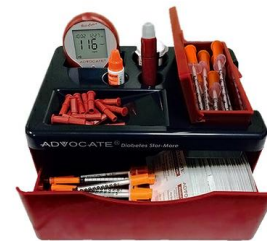
Stor-More Diabetes Organizer