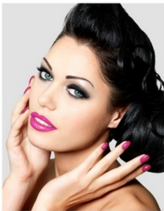
Babe LASH EXTENSIONS