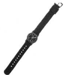
Destinate Tritium Protractor Compass