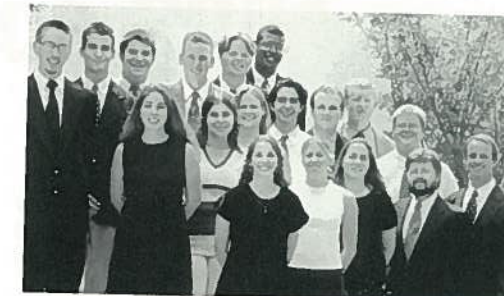
East Carolina University Percussion Ensemble