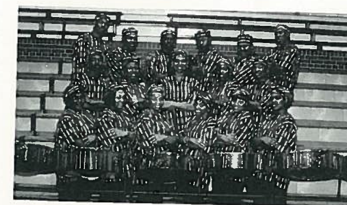
Bethune Cookman College Steel Orchestra