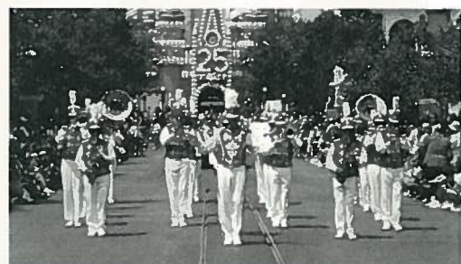
Walt Disney World Big Band