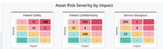
Device summary and risk details