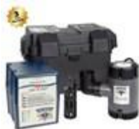
Pro Series 2400