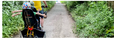
E-Bike Touring 101