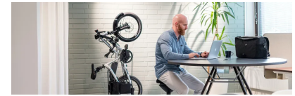
Get Your Questions Answered with New Rider-Focused Site Tools