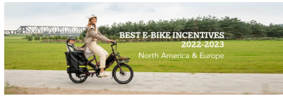
2022-2023 E-Bike Incentive Programs in North America and Europe