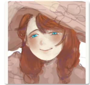
All pink dress girl by DOCHERTY L.