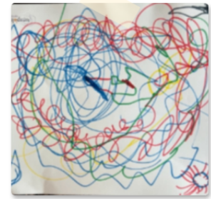
Morning Color by Reyva T.