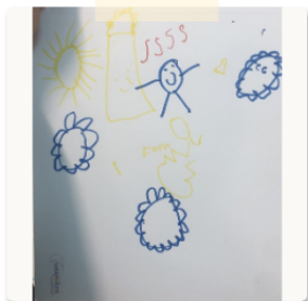
Nice Day Outside by Lynnae G.