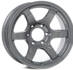
STELLER WHEELS Circuit Offroad Steller 17×8.5 Gloss Battleship Grey 6×139.7 [-10mm] (Fits Toyota/Lexus) $199.99