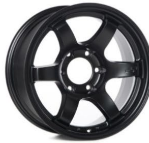
STELLER WHEELS Circuit Offroad Steller 17×8.5 Matte Black 6×139.7 [-10mm] (Fits Bronco Sasquatch™/ Raptor™) $199.99