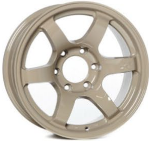
STELLER WHEELS Circuit Offroad Steller 17×8.5 Gloss Khaki 6×139.7 [-10mm] (Fits Bronco Sasquatch™/ Raptor™) $199.99