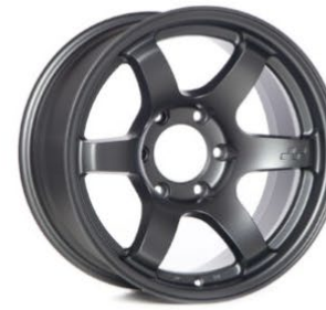
STELLER WHEELS Circuit Offroad Steller 17×8.5 Matte Gunmetal 6×139.7 [-10mm] (Fits Bronco Sasquatch™/ Raptor™) $199.99