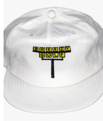
BREEZY LATE NIGHT EATS HAT