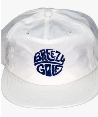
BREEZY CIRCLE LOGO HAT