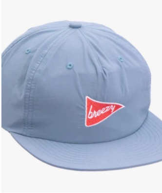
BREEZY GOLF FLAG LIGHTWEIGHT HAT